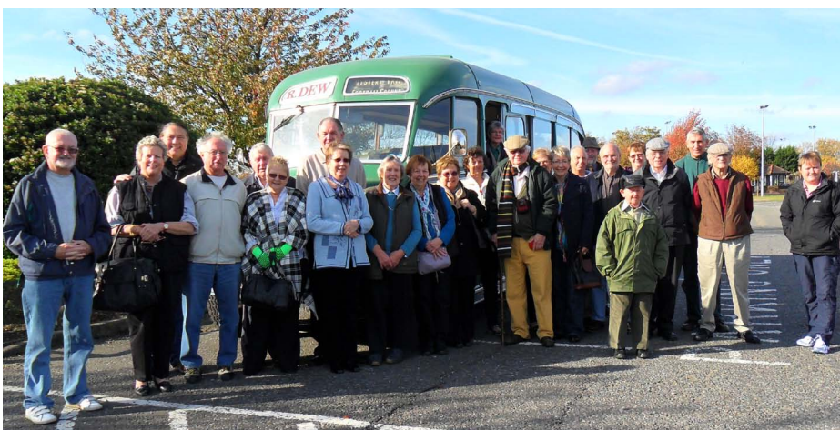
Stukeleys Heritage Group tour the site in a vintage bus