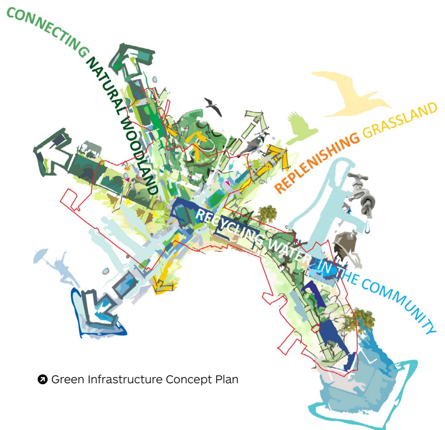
➤ Green Infrastructure Concept Plan